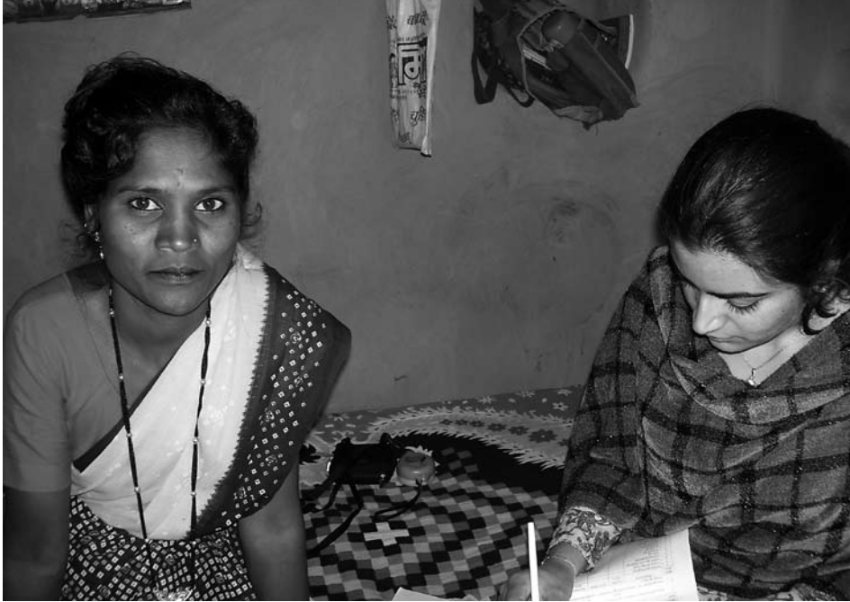
Figure 2 Key informant interview with a participant

a medical practitioner to understand a change in participants' health within this short span. But if the control group is there (people who were never exposed to an improved stove), then a comparison may be made between the 2 groups that gives a greater confidence in the results.