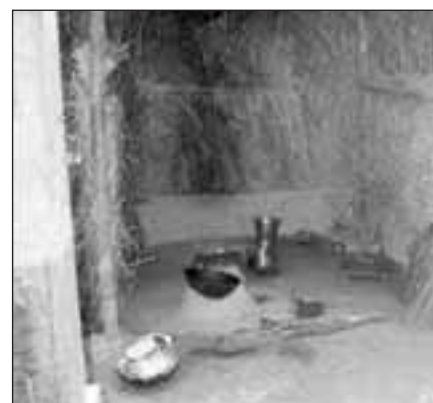
Figure 4 Cook stoves presently used in the study villages

ing capacity, but large dependence on fuelwood. Six households of the total surveyed showed a preference for biogas plants. Most of the men were aware of improved cooking systems and solar lanterns and domestic lighting systems (DLS). Table 4 gives the energy intervention plan for the village.