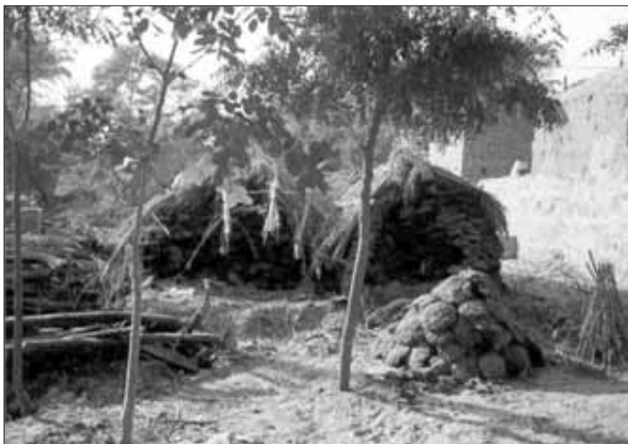
Figure 1 Cattle dung cake commonly used by the villagers for cooking

Rural people in the area largely depend upon fuelwood, crop residues, and cattle dung for meeting their basic energy needs for cooking and heating. Meeting their energy requirements in a sustainable manner continues to be a