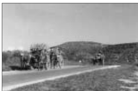
Figure 1 Dry forest near Toliara, Madagascar

The PNEBE is disseminating improved stoves in 16 cities through-