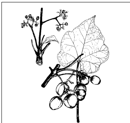
Figure 1 The Physic nut ( www.raintree.com )

Liquid fuels can be burnt in wick stoves and pressure stoves. Due to