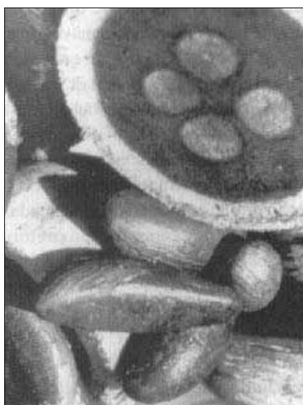
Figure 3 Babassú palm

their high viscosity, plant oils can not be used in common wick stoves. Therefore, research has been focused on combustion in pressure stoves.