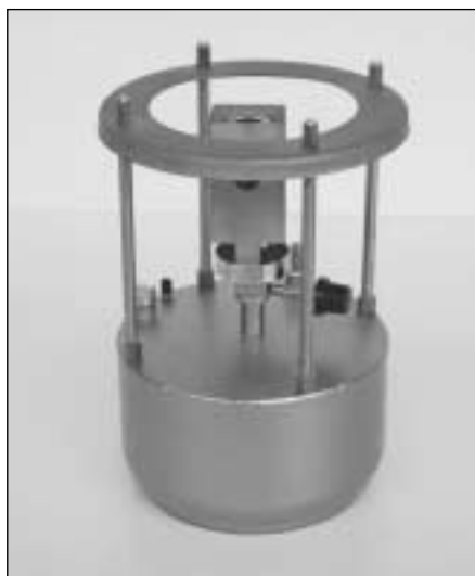
Figure 5 Hohenheim plant oil stove

A further benefit of plant oils as fuel is that they reduce the severe operating risks related to highly inflammable kerosene. The emissions of the plant oil stove are very much lower than the ones for open fires and are similar to the emissions of pressure kerosene stoves. For example, hydrocarbon emissions of the plant oil stove were measured to be 370 times lower than the emissions of an open fire with comparable power output. Likewise, the carbon monoxide and the nitrogen oxides emissions of the open fire are 120 times and 15 times higher than the emissions of the plant oil stove, respectively.