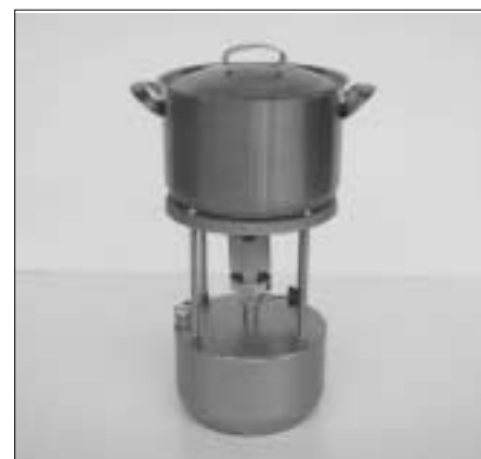
Figure 6 Hohenheim stove with pot

Utilization of the plant oil cooking stove has numerous ecological, economical, and sociological benefits. Plant oils are a sustainable energy source ensuring a sustainable supply of cooking energy. Introduction of the new plant oil cooking stove can be readily acceptable to people in tropical and subtropical countries since its operation is similar to the familiar kerosene stoves.